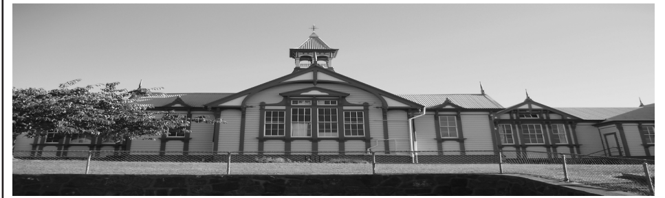
Historic walk leaving the Community House and going to the Onehunga Mall to visit shops with a historical connection to Onehunga Primary School and the Community House followed by a Victorian afternoon tea.

Cost $20. - Bookings are essential. Please ring the community house 8.30-12.30pm