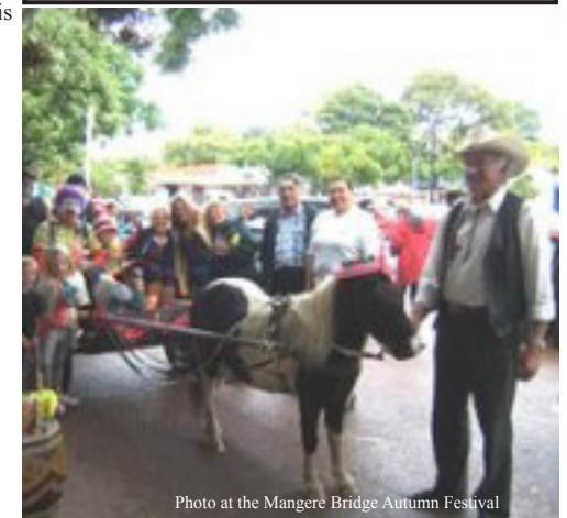
Photo at the Mangere Bridge Autumn Festival